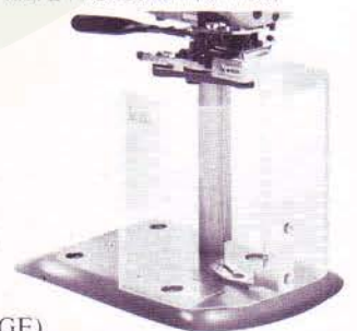
KNIFE PROTECTOR (OPTION)